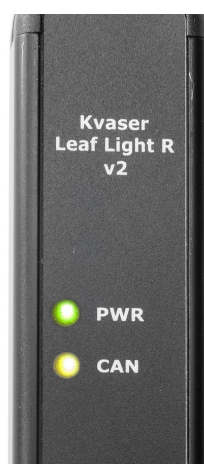
Figure 4: LEDs on the Kvaser Leaf Light R v2.

The Kvaser Leaf Light R v2 has two LEDs as shown in Figure 4. Their functions are shown in Table 2 on Page 9.