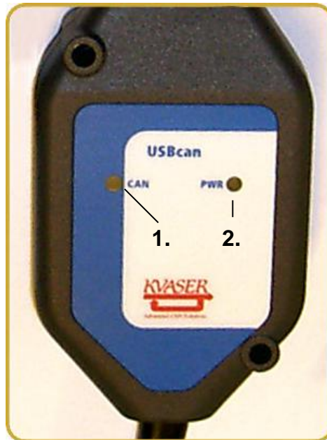
Figure 4. USBcan Rugged. LED configuration.