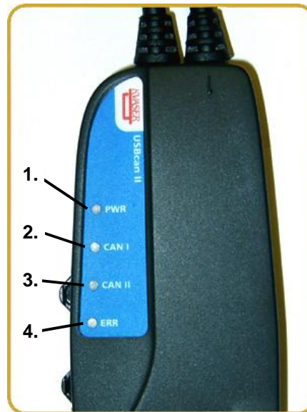
Figure 3. USBcan II LED configuration.

The LED's have somewhat different meaning on the different hardware. See Table 2 for USBcan II or Table 3 for USBcan Rugged.