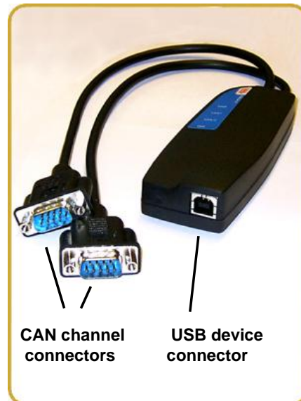
Figure 1. Connectors on the USBcan II.

The standard USBcan II has two independent I/O ports (CAN channels) depicted in Figure 1. The first channel, Channel 1, is marked with '1'; the second, Channel 2, is not marked. See Figure 2.